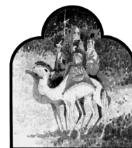
Magi from the east arrived

On Monday, January 9 there will be a special time for Eucharistic Adoration from 8:30AM to 12 Noon as an opportunity to spend time before the Blessed Sacrament to pray for an increase in vocations to the Priesthood. Plan to set aside some time that morning for this important intention.